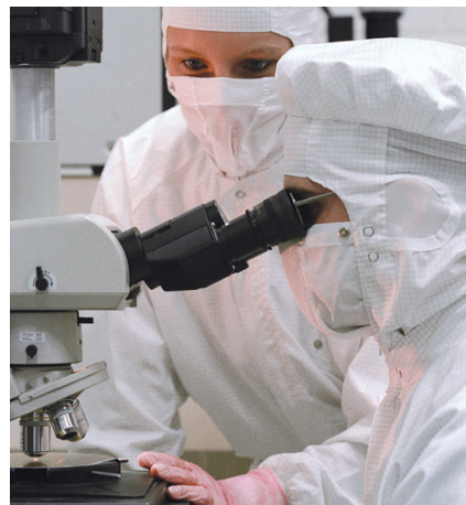
Bosch says its sales of driver-assistance components are rising by one-third annually.

Because automakers must integrate key safety functions such as steering, brakes, radar and cameras, Carlson said, they will