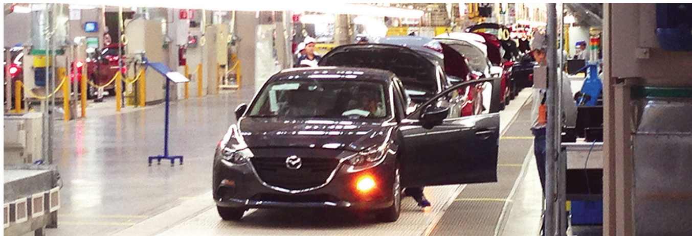
Cars are built in Mazda's Salamanca, Mexico, plant. Automakers' plans to add production in Mexico are luring Asian suppliers.

Toyota Gosei Co., a major supplier of interior components, airbags and exterior trim, launched production at its third