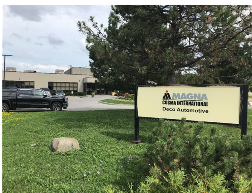
Today, our facilities total 375,000 sqft.