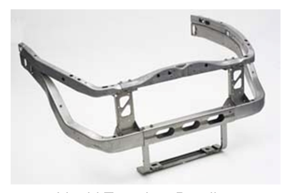
Liquid Transient Bonding Tube to Tube Joining