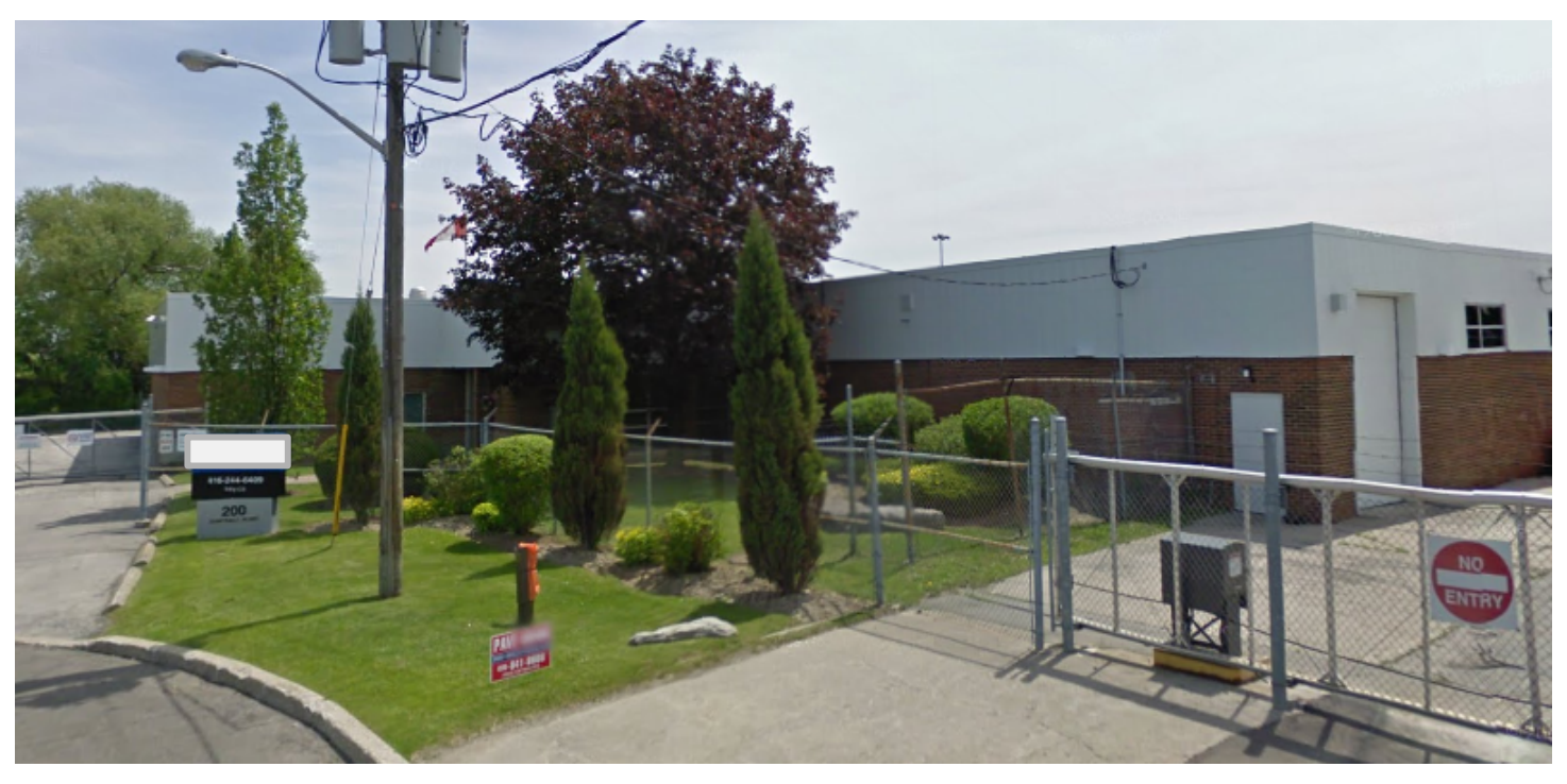
In 1971, Deco moved to this location in Weston, Ontario. This building was 50,000 sqft. Stamping only.