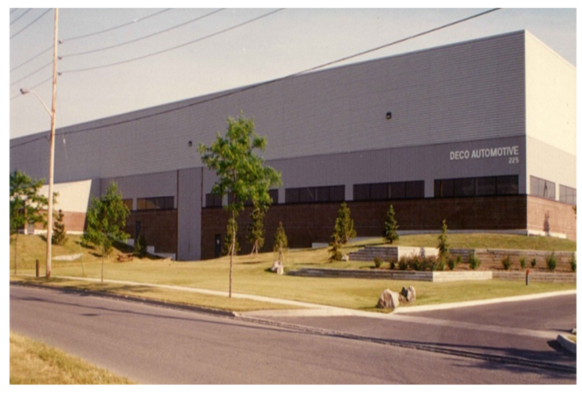
In 1986, Deco moved to our current location in Rexdale, Ontario. This building was 100,000 sqft.