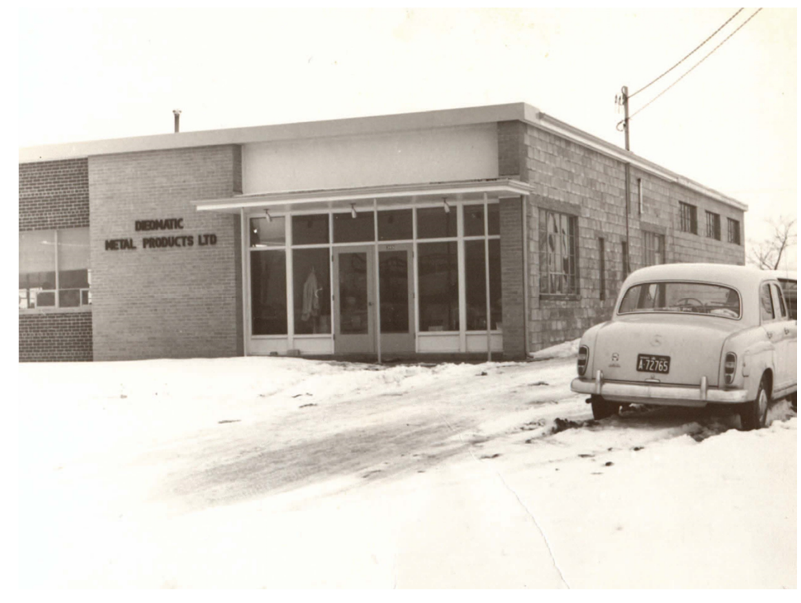
Dieomatic Metal Products Incorporated December 12, 1959