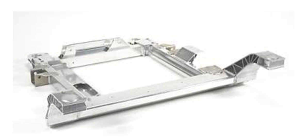
Aluminum Engine Cradle