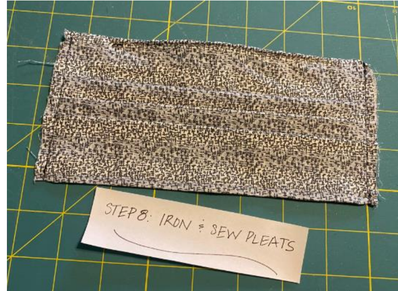
Step 8: Iron & sew pleats into place.