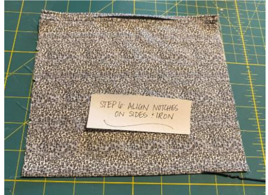
Step 6: Align notches on sides and iron.