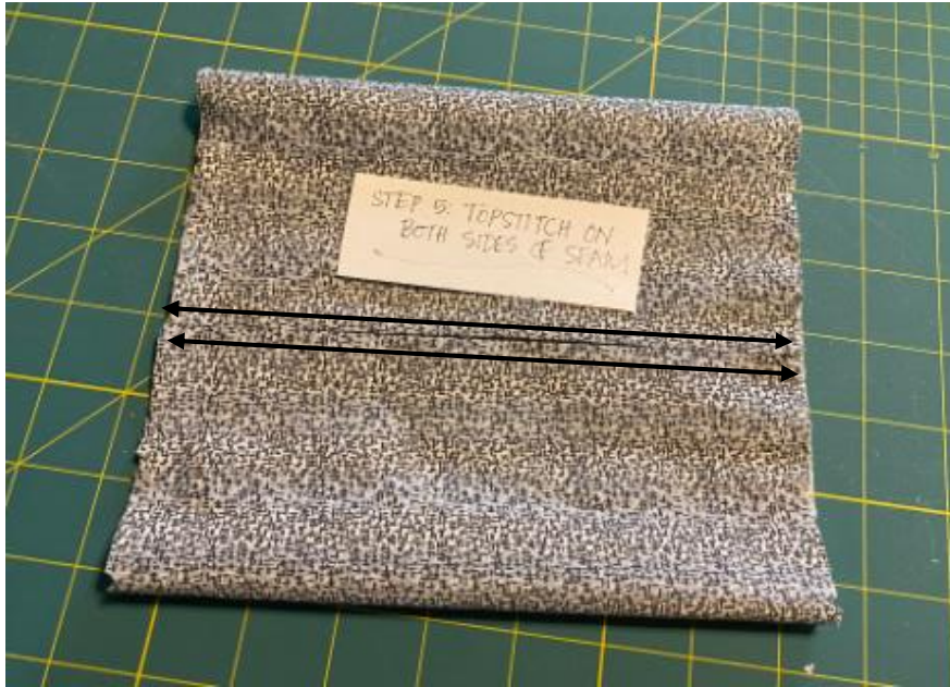
Step 5: Topstitch on both sides of seam.