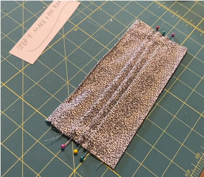
Step 7: Make and pin pleats.